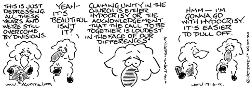
Agnus Day appears with the permission of www.agnusday.org