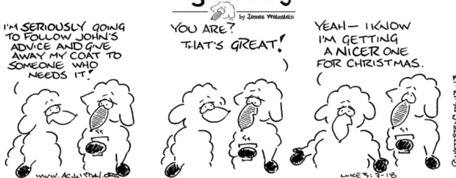
Agnus Day appears with the permission of www.agnusday.org