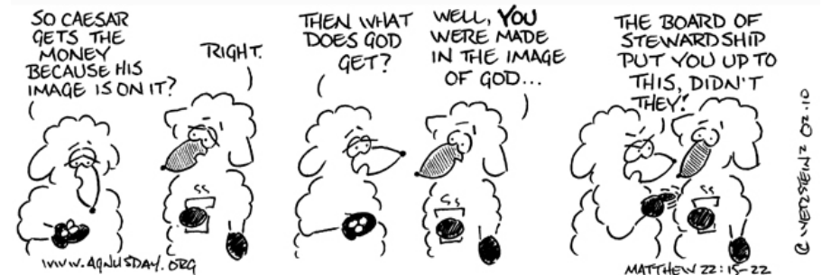
Agnus Day appears with the permission of www.agnusday.org