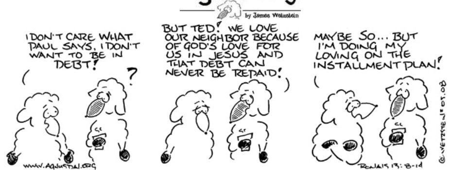
Agnus Day appears with the permission of www.agnusday.org