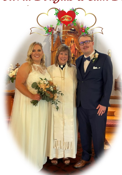
Saturday, May 27, 2023