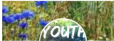
Rocket Youth Group

Enjoy Social Time At Our Coffee Luncheons Join St. Paul's Normanby after their services, at the Neustadt Community Center We look forward to seeing you there! Donations welcome in support of the Salvation Army Food Bank